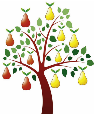
La Cuillère de Bois